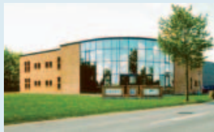
The Partner Voxstream premises in Vamdrup

Save costs Turn ISDN into low cost VoIP communication